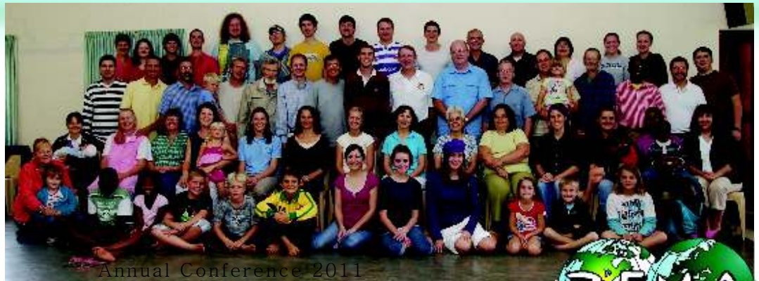
Annual Conference 2011