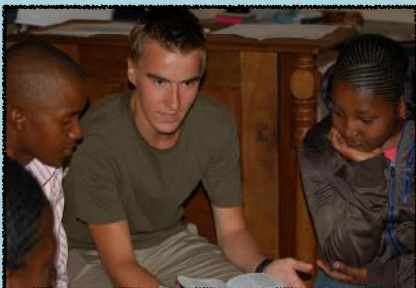
KRUGERSDROF, GAUTENG The short-term team from Christ Community Church kicked off their trip with a youth camp in Gauteng province: three days packed full of intense Bible study, worship, and fellowship with amaZioni youth.

To sum it up, short-term mission trips need to be approached positively but not lightly. When they are planned and carried out with this mind-set, as a fellow ZEMA missionary put it well: "the devil doesn't stand a chance!"